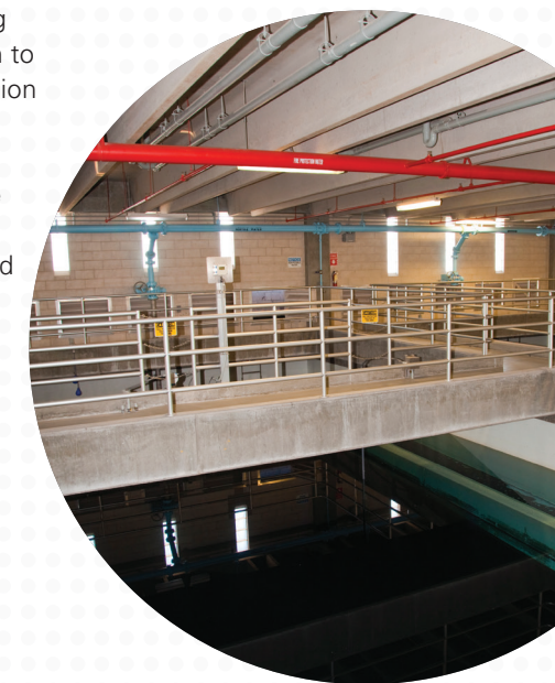
above: Water Treatment Plant Scottsdale, AZ

Tnemec's Severe Wastewater Analysis Test (S.W.A.T.), an accelerated wastewater corrosion-testing program, was developed to evaluate the level of coating degradation after exposure to a simulated headspace environment. Information obtained from liquid and vapor testing is extremely valuable, giving specifiers quantifiable data, which demonstrates the performance of various products and reassures owners that their assets will receive long-term protection. In 2013, ASTM International recognized the test's value by standardizing the procedure and issuing ASTM G210-13: Standard Practice for Operating the Severe Wastewater Analysis Testing Apparatus.