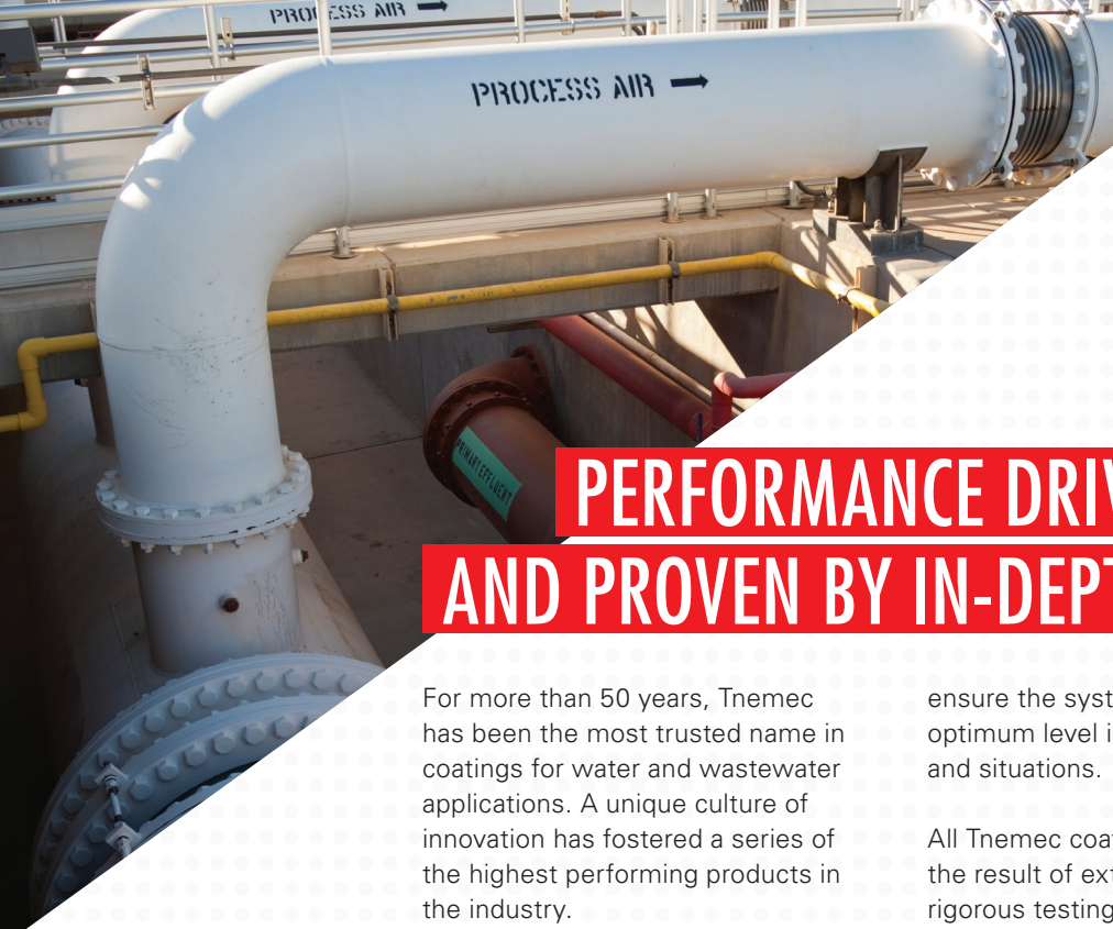
left: 91st Avenue Wastewater Treatment Plant Tolleson, AZ