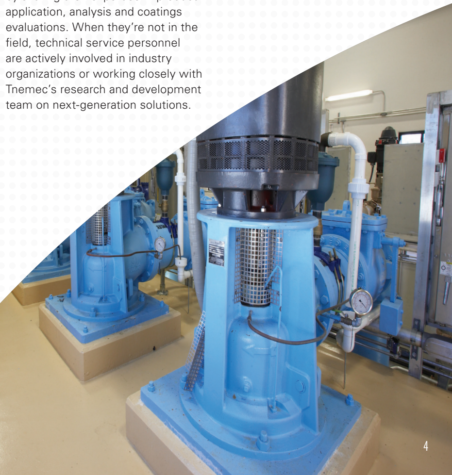
right: Hutchinson Water Treatment Plant Hutchinson, KS