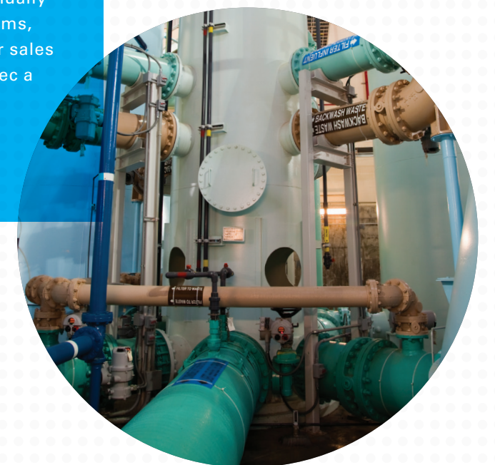
right: City of Litchfield Water Treatment Plant Litchfield, IL