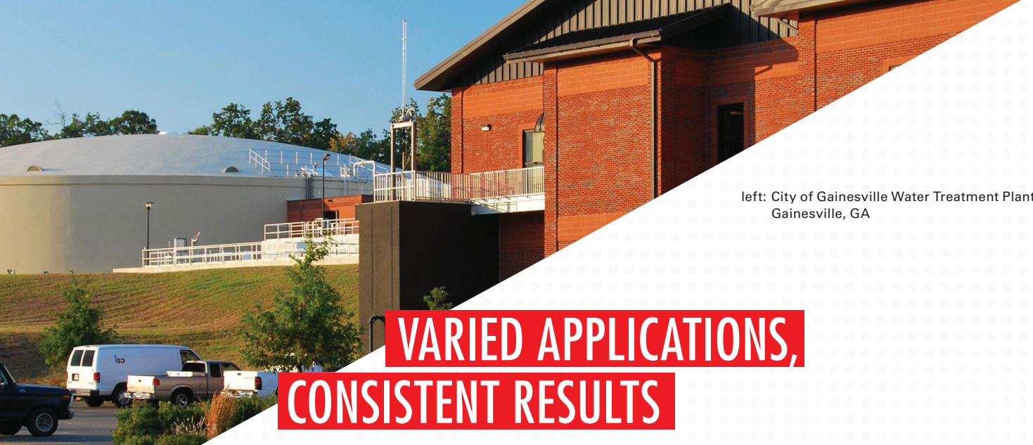
left: City of Gainesville Water Treatment Plant Gainesville, GA